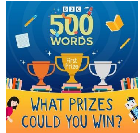
Pictured: BBC 500.

The BBC's 500 Words is the largest children's writing competition in the UK, and its deadline for entries is this week! Children aged 5-11, who are currently residing in the UK, are invited to submit a story they would love to read in 500 words or less. The competition is a celebration of creativity, so spelling, punctuation and grammar are not marked. BBC's 500 Words said, 'We want children to have fun writing their stories, be as creative as they can and make us laugh, cry or just be blown away by what we are reading. Children are encouraged to write a story they would love to read themselves. Over the years there have been incredible stories submitted.'