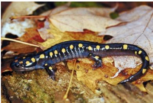
Pictured: Salamander in autumn leaves.

A wildlife conservation and advocacy group is encouraging Americans to 'Leave the Leaves'. It is part of a campaign to inspire people to take a break from raking and consider the importance of leaf litter for wildlife. Organisers, the National Wildlife Federation, explain, 'Songbirds, small mammals, amphibians, and reptiles all rely on the leaf layer in some way. Many beloved insect species like butterflies, moths, and fireflies use this layer as a safe spot to wait out the winter, and