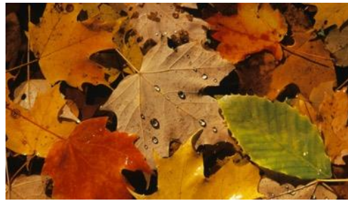
Pictured: Autumn leaves.

others forage in and even eat the decomposing leaves.' The 'Leave the Leaves' campaign is all about utilising fallen leaves rather than throwing them away. The National Wildlife Federation recognises that a thick layer of leaves in gardens can damage grass, leaving lawns unsightly. Paths can also become slippery and dangerous. However, they suggest moving the leaves is the answer, as it not only benefits the wintering wildlife, but also benefits your garden! Placing them on garden beds helps suppress weeds and adds nutrients to the soil, or piling leaves in the corner of the garden will produce the most incredible compost.